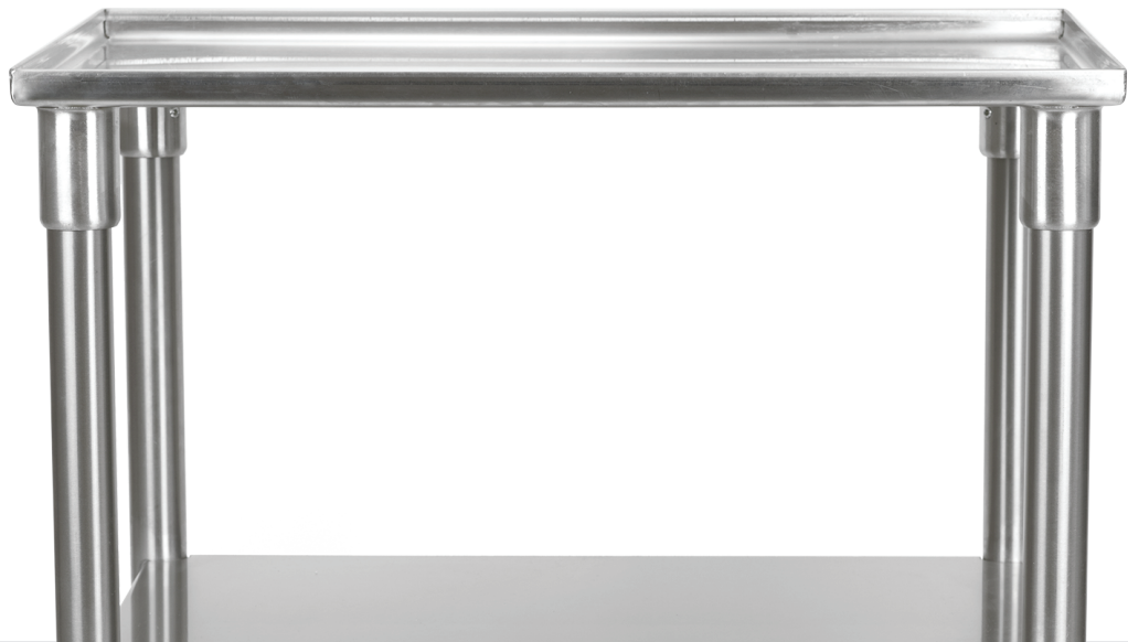
Utility Cart UT1300

The UT1300 utility cart has been specifically designed for our line of dough presses. It features 26.5" height, pre-drilled mounting holes to bolt your unit down for safety. Easy gliding casters allow you to move over thresholds and across carpeting.