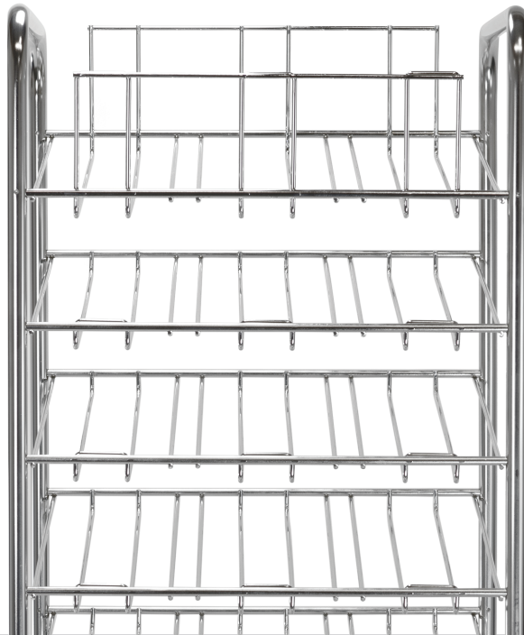
DC96 Dough Cart

Loading and unloading is fast, easy and practically automatic with the gravity flow. The chutes are sequentially feeding, first-in, first-out.