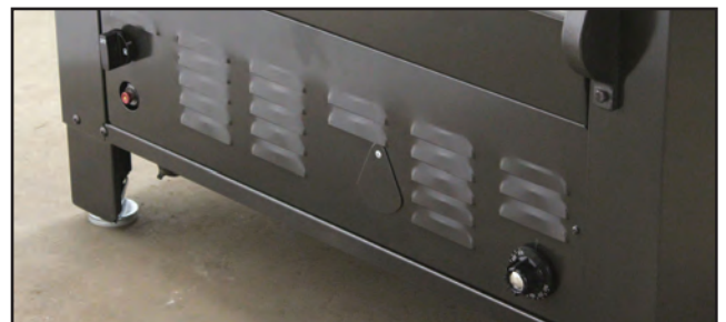
Easy access front controls