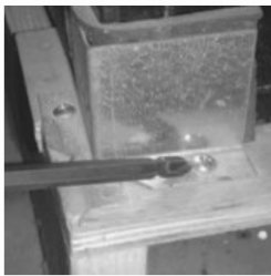
Image 1 Removing bracket from skid