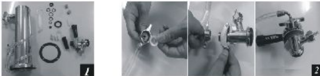
1. Beer tower install contents. 2. Thread beer line connector to keg coupler.