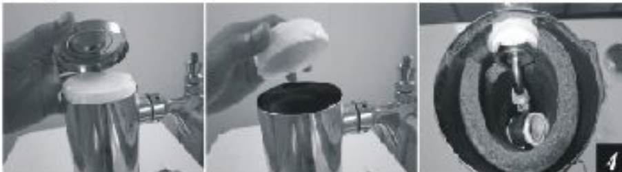
4. Make sure the air hose closes to the top of beer tower at all times, to keep the beer faucet cold.