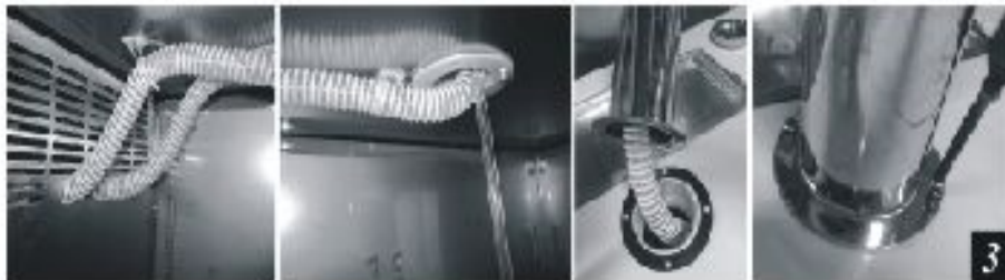
3. Insert air hose into the beer tower and secure beer tower to cabinet with the gasket under the beer tower.