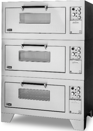
Model D054R3 shown